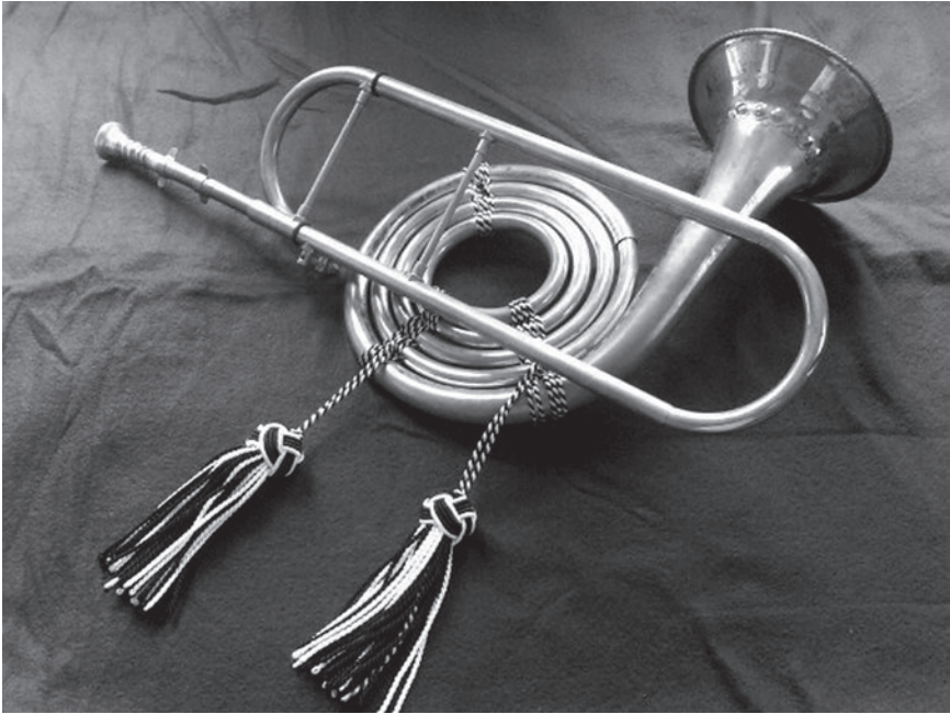
FIGURE 5.3. A reproduction of a corno da tirarsi by Rainer Egger.

Although only six of Bach's cantatas call for the slide trumpet by this name (BWV 5, 20, 46, 67, 77, 162), some scholars believe that a large number of cantata movements (especially chorale movements) were intended for the instrument where it was not specifically named. 7 Where it is named, Bach consistently uses the Italian, tromba da tirarsi , with the exception of BWV 67 and 162, which call for corno da tirarsi .